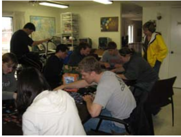
Catholic Schools Volunteers