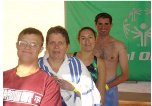
Swimmers at State Meet